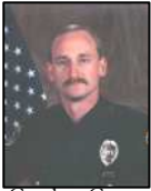
Gordon Gray Chair